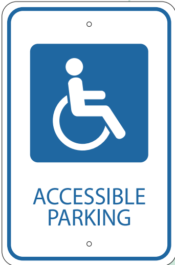
18" x 12"