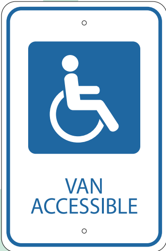
18" x 12"