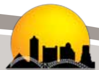
22" x 9 1/2"